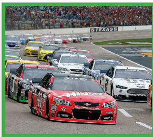
Peterbilt Motors Company – Texas Motor Speedway Experience