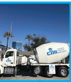
Con-Tech Manufacturing, Inc. and Kenworth Central Florida – Mixer and Truck