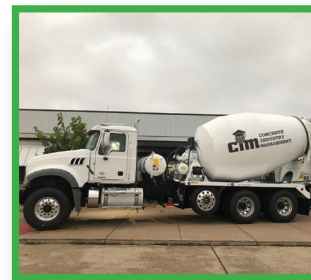
Mack Trucks, Inc. and Beck Industrial mixer and truck