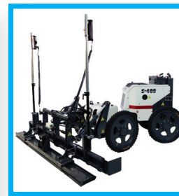
Somero Enterprises, Inc. 485 laser screed machine